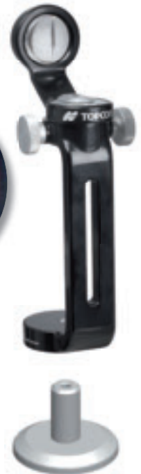
Storing stand (FV-1L) (optional accessory)